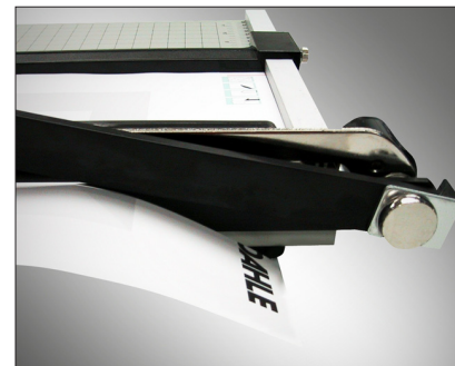
Spring action blade will return to the up position after trimming to reduce fatigue.