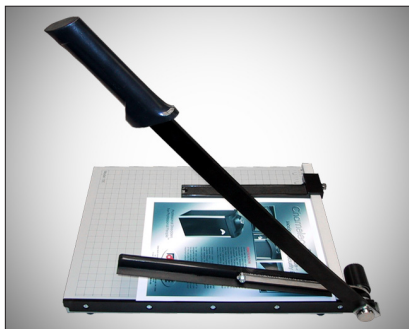
The automatic paper clamp securely holds your work in place and prevents paper shifting.