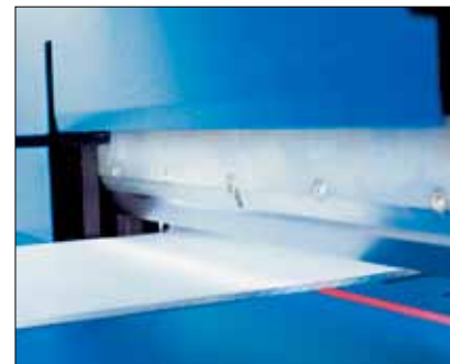
Ground Solingen steel blade cuts through up to 200 sheets of paper with ease.